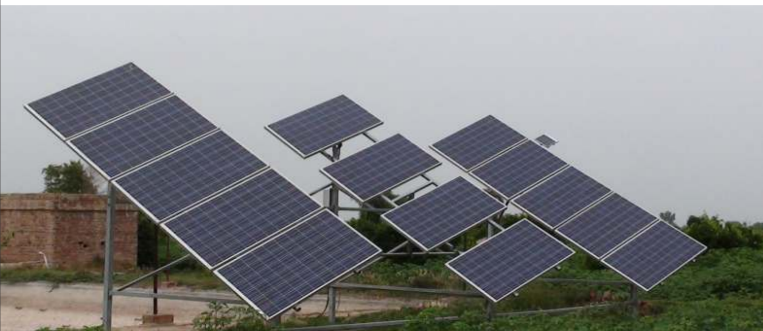
Solar water pumping set at Bassi, Jaipur