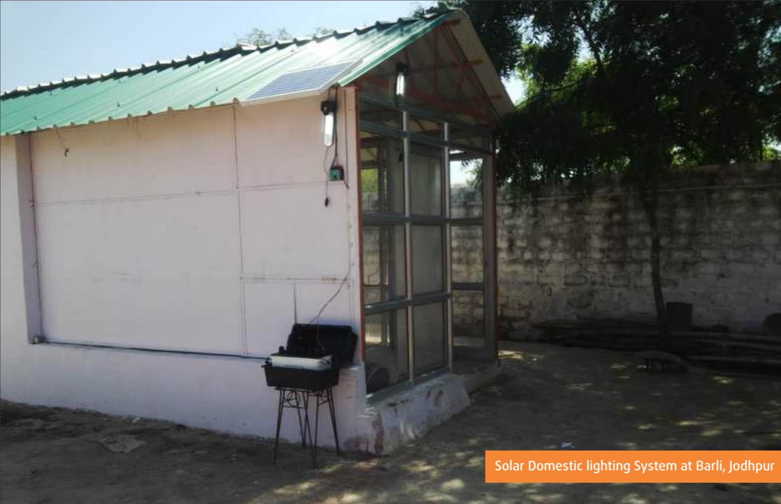
Solar Domestic lighting System at Barli, Jodhpur

schedule for sale of power to licensee / third party or for giving set-off against the consumption of recipient unit in case of captive use as per the relevant regulations of RERC. However, total available Solar Power Plant generating capacity shall be intimated to RVPN / Discoms of Rajasthan for next day.