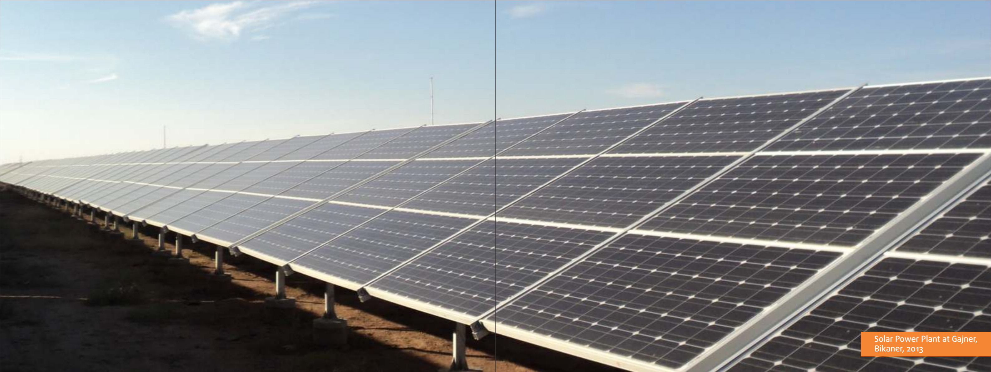
Solar Power Plant at Gajner, Bikaner, 2013