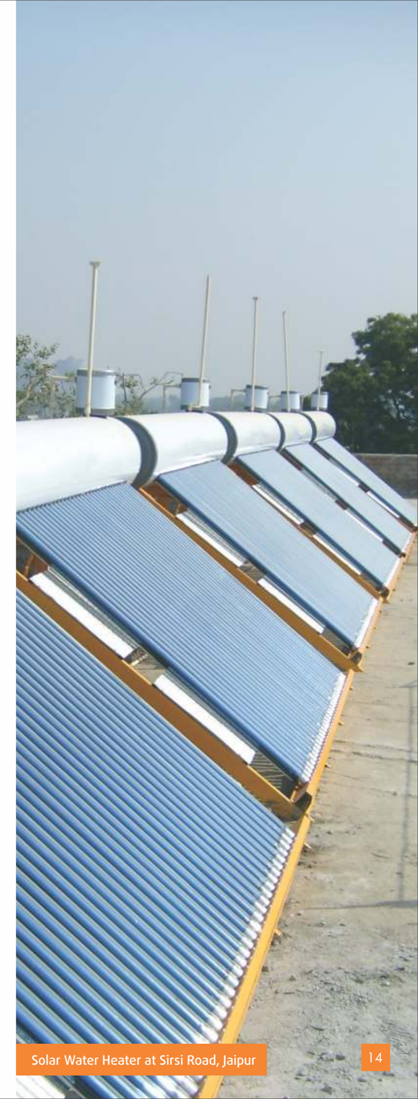
Solar Water Heater at Sirsi Road, Jaipur

17.3 Solar Power Producer to whom Government land is allotted will have to apply for final approval of the project within three months from the date of in-principle clearance by SLSC. If Solar Power Producer fails to apply for final approval of the project within the time prescribed, RREC will recommend for the cancellation of allotment of Government land with the approval of SLEC