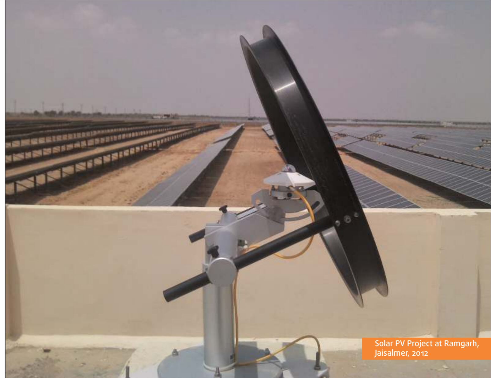
Solar PV Project at Ramgarh, Jaisalmer, 2012