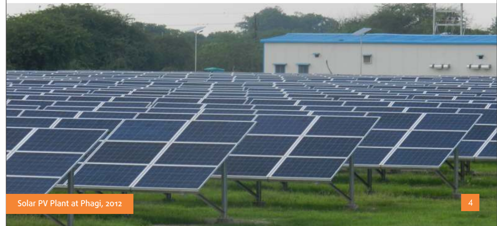
Solar PV Plant at Phagi, 2012