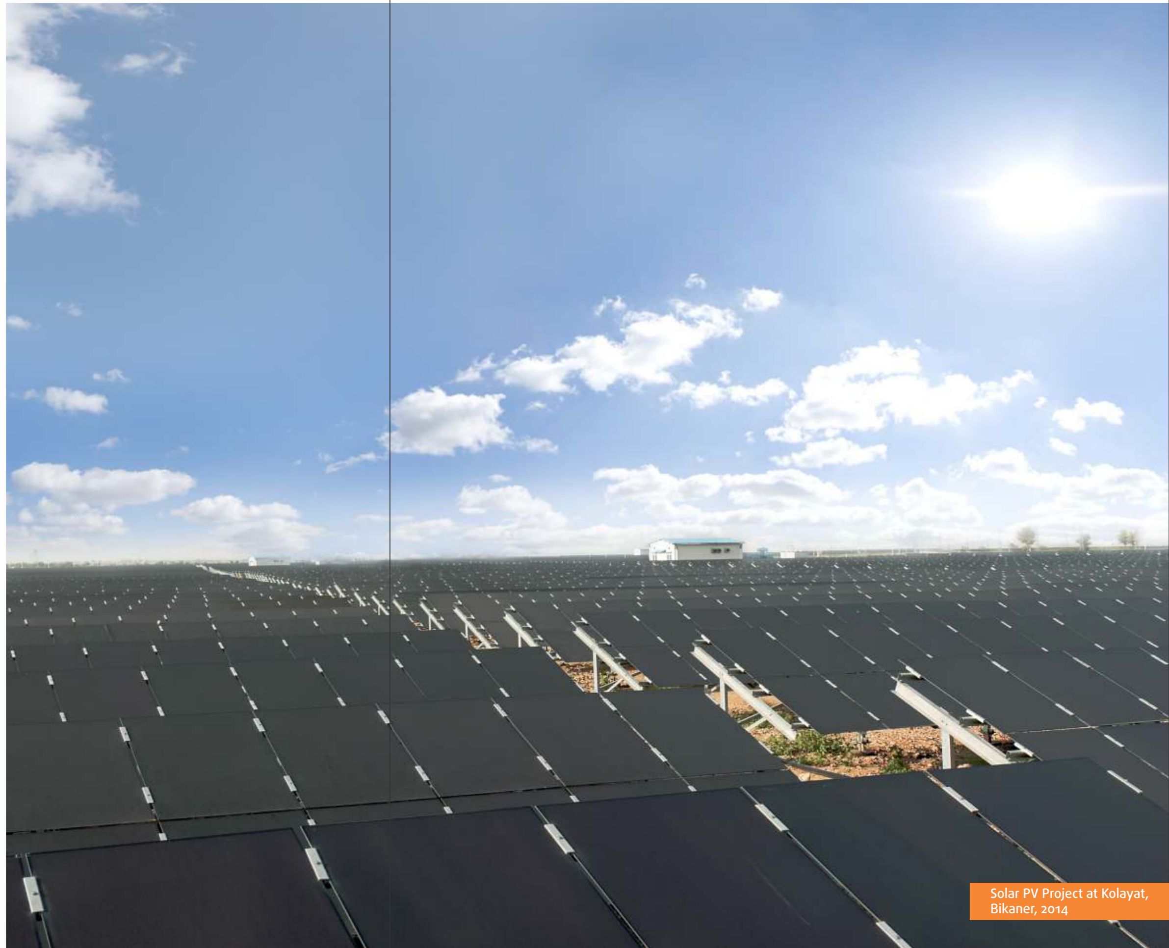
Solar PV Project at Kolayat, Bikaner, 2014

Rajasthan State Pollution Control Board with a view to encourage Solar Power plant in the state has notified solar power plant of all capacities under Green Category. The State Board will issue comprehensive consent to establish and consent to operate for one project. The State